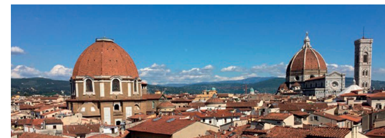
Florence from the terrace of the Hotel Baglioni, Congress location

APOS is eager to establish a dialogue with the fellows even after the Congress, seizing the opportunities offered by the web (see the Facebook link) and by a series of satellite courses that are being programmed.